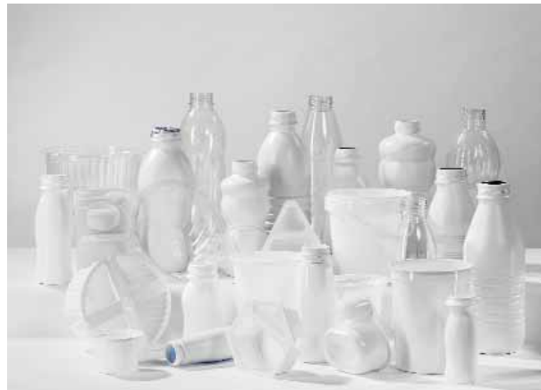
Hygienic filling of cups and bottles for liquid and viscous food Bosch offers a wide range of solutions for the filling and packaging of sensitive products, such as dairy and baby food in cups and bottles.

For customized solutions dedicated to the packaging of sensitive dry and free-flowing products such as coffee, Bosch offers the machine family PME. Due to its modular design, the PME stands for high flexibility and premium quality because either soft or vacuum bags with different head closures can be produced on one machine. In addition, this vertical package maker can be equipped individually with Bosch product protection systems such as inside and outside valves and their